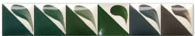
CN 163 Dark Wintergreen CN 173 Dark Kelp CN 183 Dark Kiwi CN 193 Dark Ivy CN 203 Dark Grey CN 213 Dark Taupe