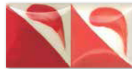
CN 074 Really Red CN 384 Fruit Punch