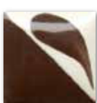
CN 233 Dark Briarwood