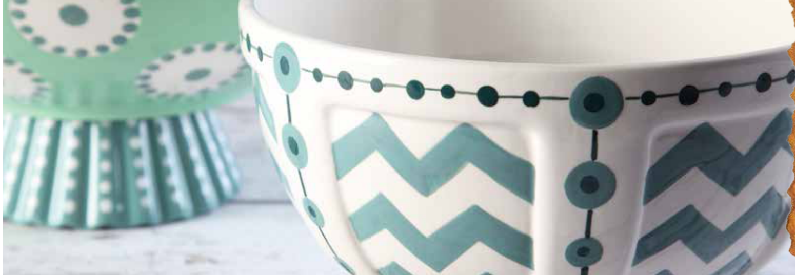
Painted by Suzie Shinseki