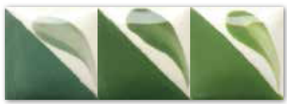
CN 162 Bright Wintergreen CN 172 Bright Kelp CN 182 Bright Kiwi