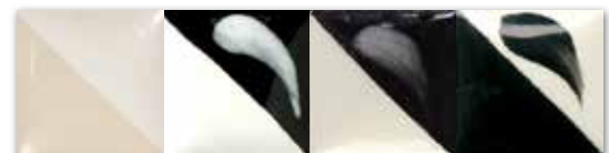
CN 362 Ivory CN 244 Really White CN 241 White CN 253 Black