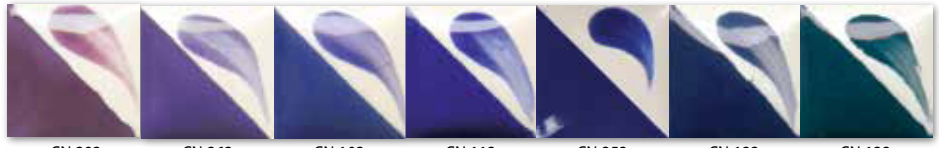
CN 293 Dark Purple CN 263 Dark Grape CN 103 Dark Heather CN 113 Dark Delft CN 353 Dark Sapphire CN 123 Dark Nautical CN 133 Dark Tidepool